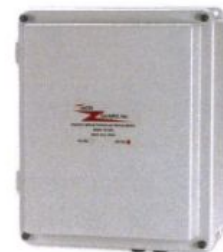
VOT BD or VOT RC