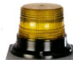
LED Strobe Light

Approvals: (UL) C(UL) Listed. FCC Specifications and Features Subject to Change Without Notice